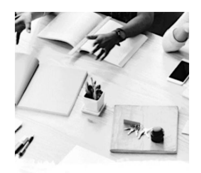
Educator Webinar Making Career Educatio

During this webinar on 17th May from 15:30-16:00 , F4S will explain how you can book inspiring speakers and role models using their website. They will also signpost to relevant research and resources to support your work, along with sharing 'what's on' at F4S, such as Maths4Girls and Sustainable Futures.